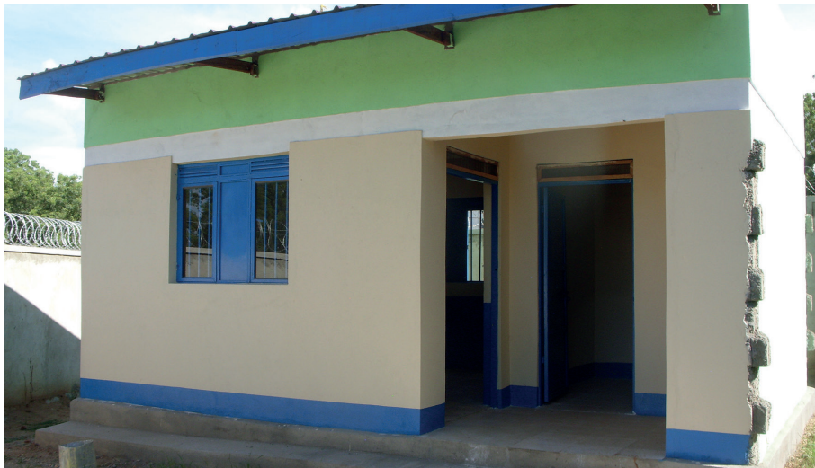
The almost completed Health Clinic