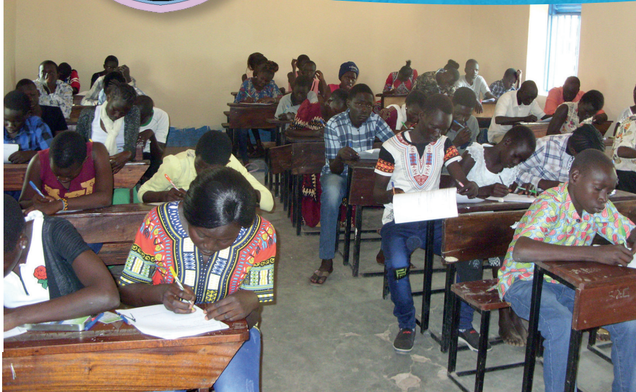
Nearly 800 hopeful students sat this year's entrance exam