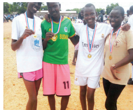
The winning girl team in the 4 x 400m relay