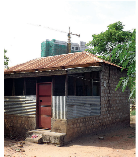
The proposed new house for the Headmaster is undergoing refurbishment

Keep up-to-date with all the latest news on the school by visiting its website at: www.jdmss.co.uk .