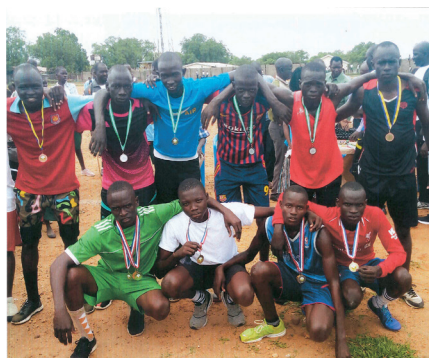
Some of the medal winners of various boys events at Sports Day